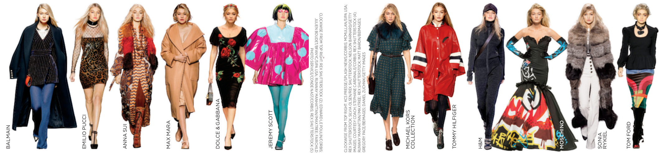
BALMAIN EMILIO PUCCI ANNA SUI MAX MARA DOLCE & GABBANA JEREMY SCOTT MICHAEL KORS COLLECTION TOMMY HILFINGER H&M MOSCHINO SONIA RYKIEL TOM FORD

ALL HAIL THE NEW CATWALK QUEEN! Gigi Hadid WAS A DESIGNER GO-TO THIS SEASON—SHE WALKED IN 12 SHOWS.