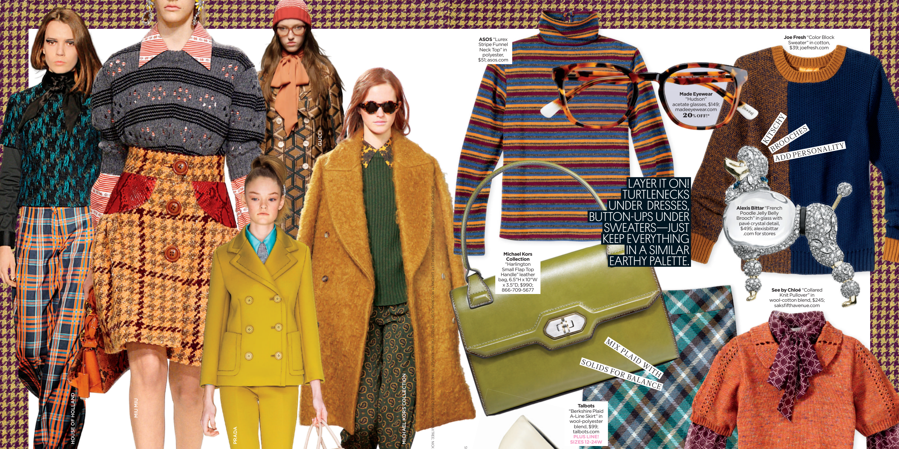
ASOS "Lurex Stripe Funnel Neck Top" in polyester, $51; asos.com