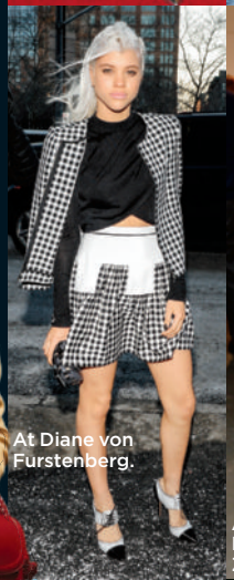
At Diane von Furstenberg.