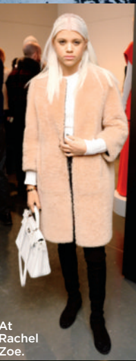
At Rachel Zoe.