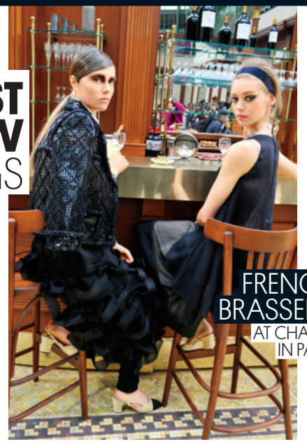
FRENCH BRASSERIE AT CHANEL IN PARIS