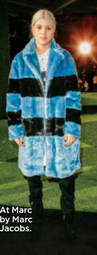
At Marc by Marc Jacobs.