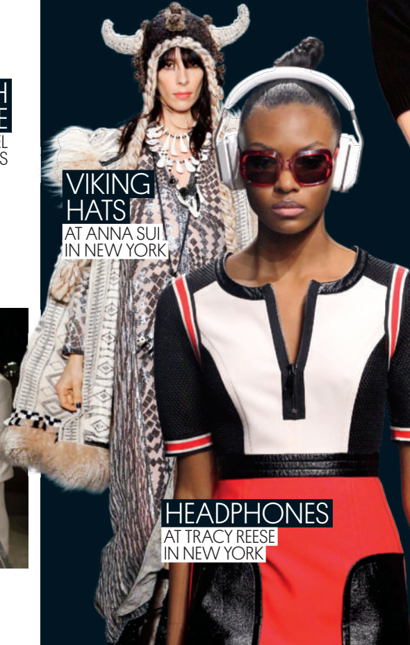
VIKING HATS AT ANNA SUI IN NEW YORK