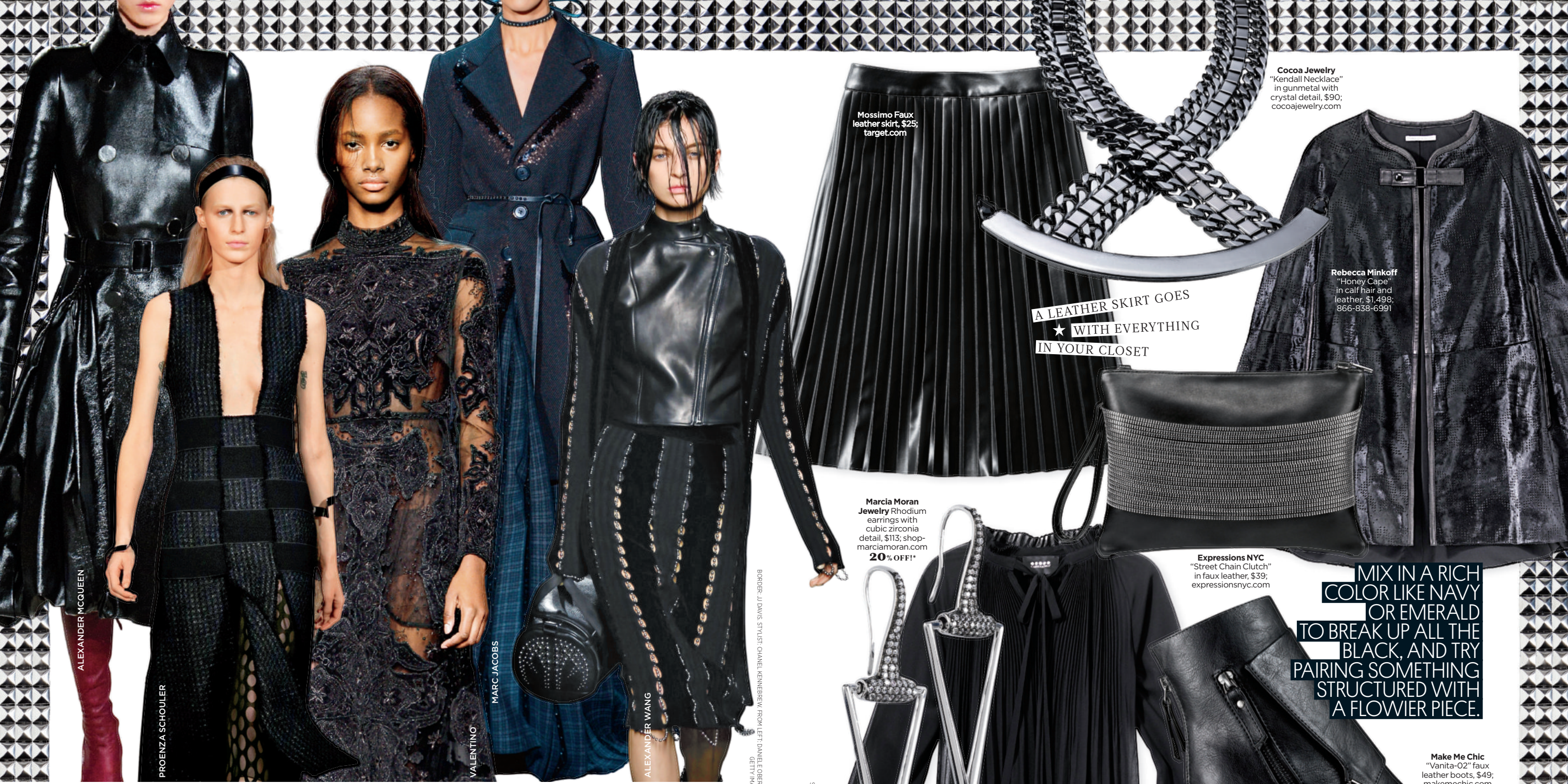
Cocoa Jewelry "Kendall Necklace" in gunmetal with crystal detail, $90; cocoajewelry.com