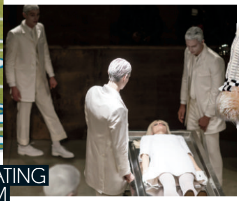
OPERATING ROOM AT THOM BROWNE IN NEW YORK